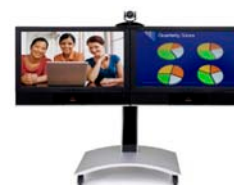
Polycom HDX 8000™