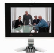
Polycom HDX 4000™